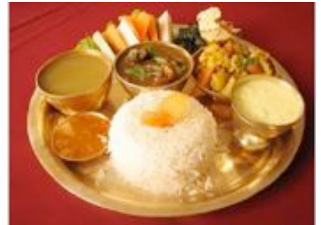
Example of Nepali Cuisine