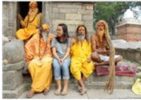
Devote of Lord Shiva