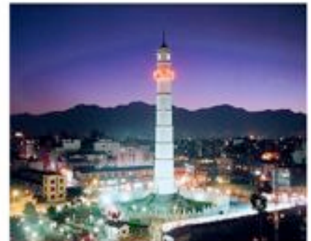
Bhimsen Stamba (Dharahara)