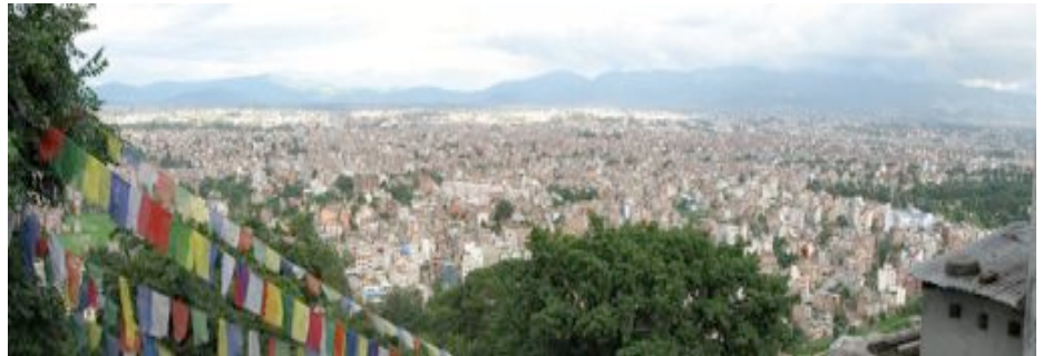
Kathmandu Valley Panorama