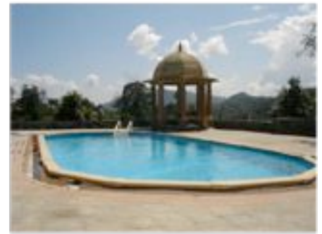
Enjoy the wide swimming pool at Resort