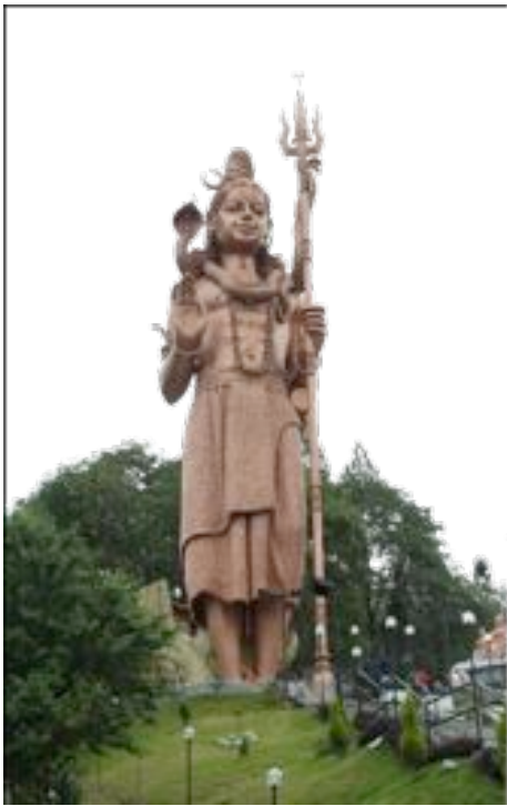
World Tallest Lord Shiva Statue