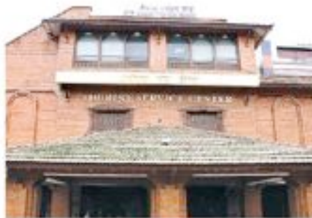
Nepal Tourism Board